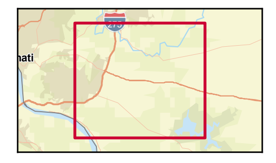
February 09, 2022